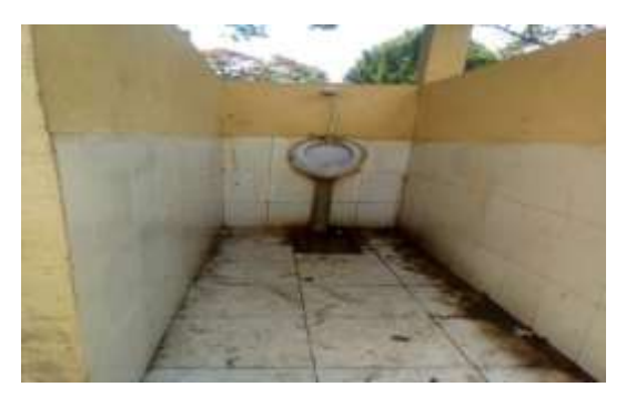
Toilet and Urinal