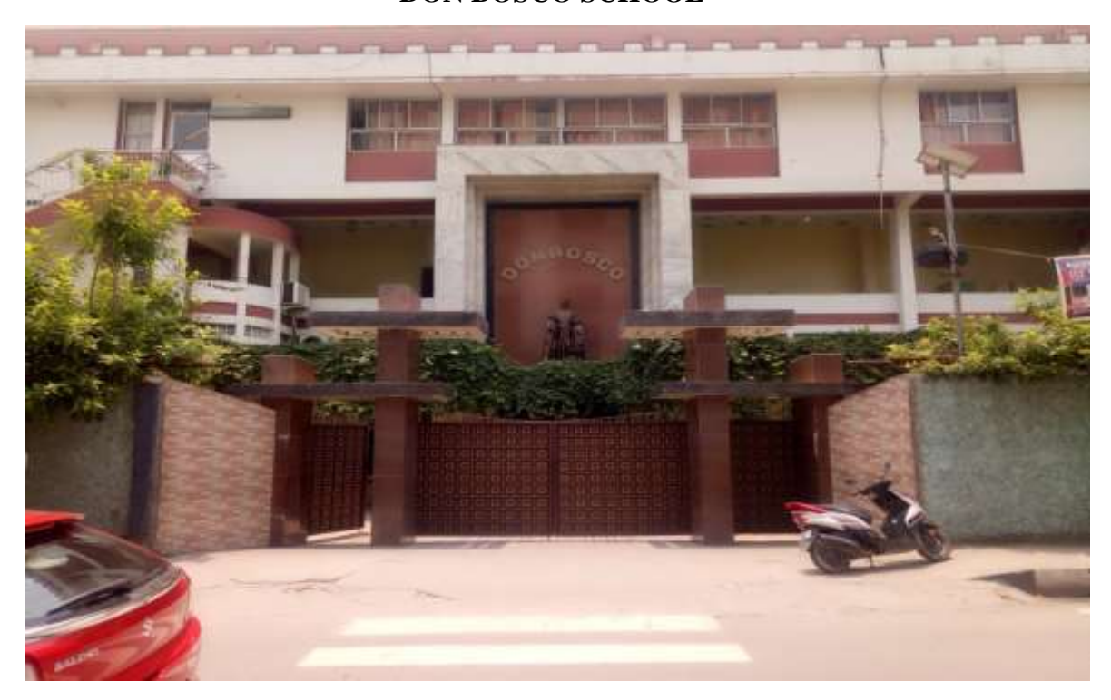
Don Bosco School