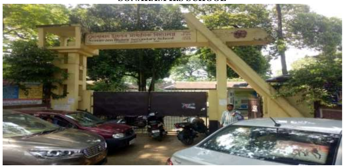
Sonaram H.S School