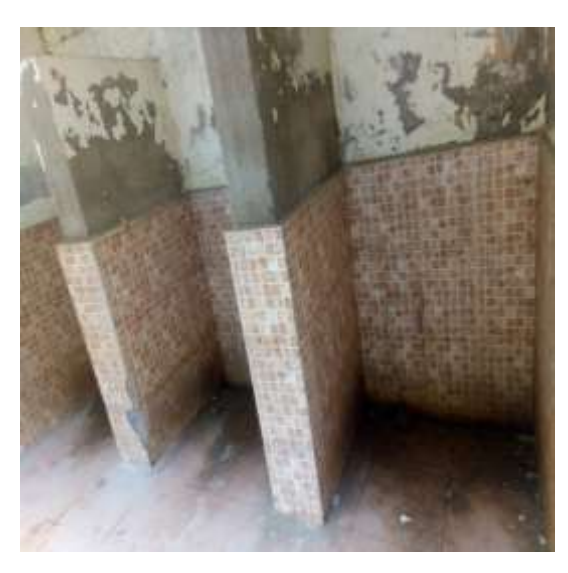
Toilet and Urinal facility