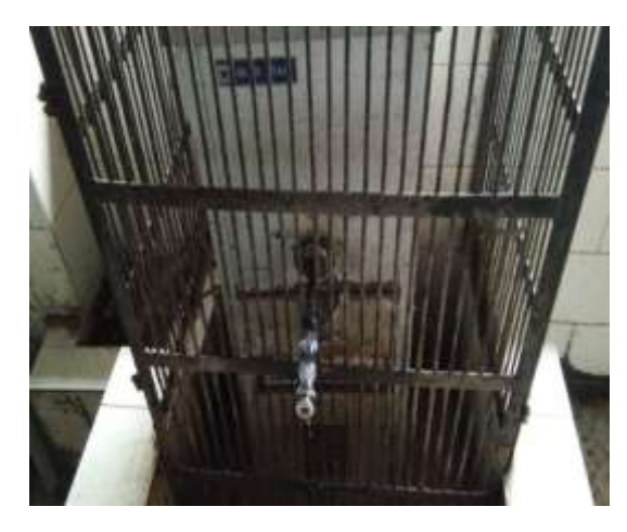
Drinking water facility