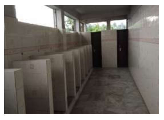
Toilet and Urinal