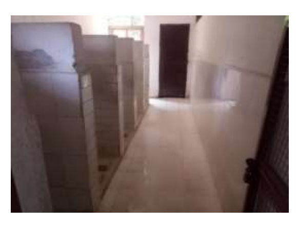
Toilet and urinal