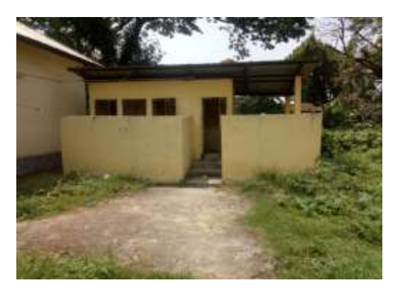
Toilet and Urinal