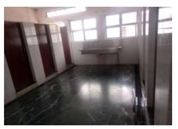
Toilet and Urinal facility