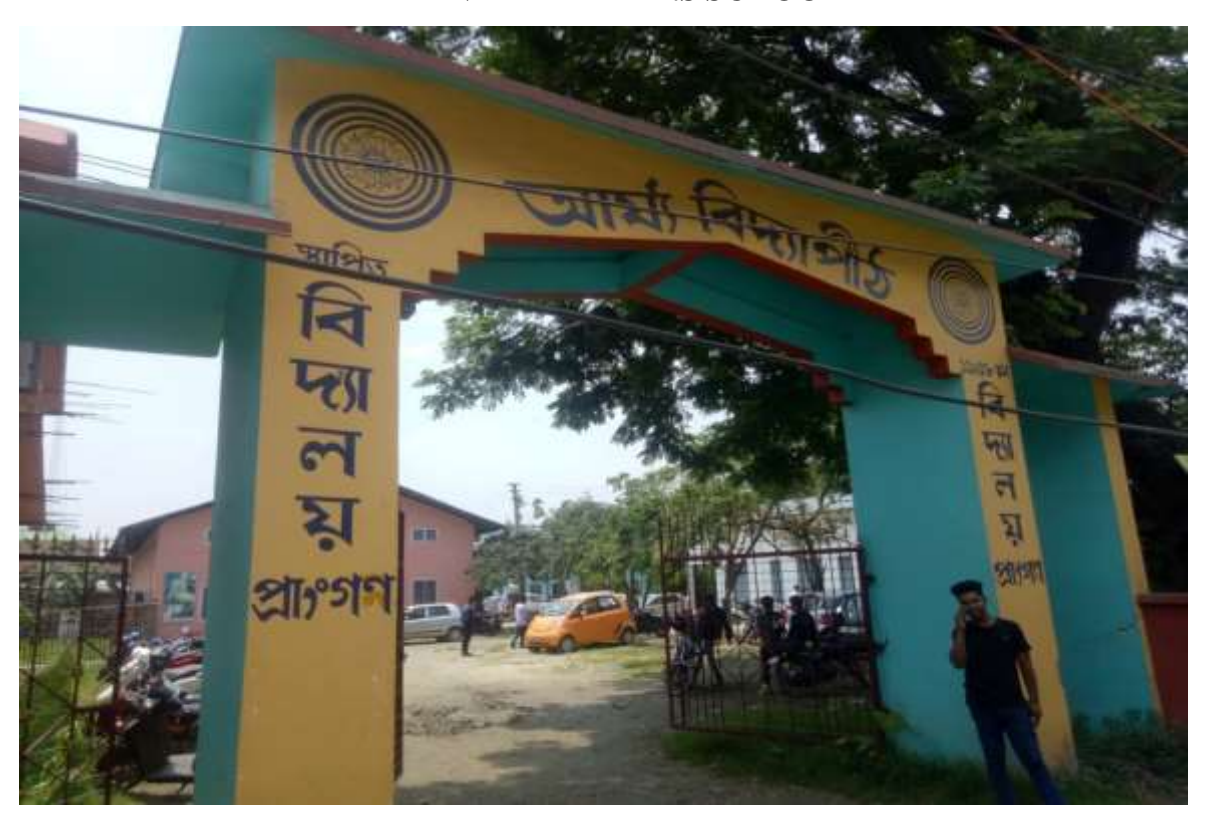
Arya Vidyapith H.S School