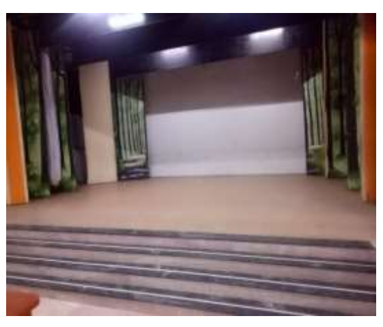
Stage of Auditorium