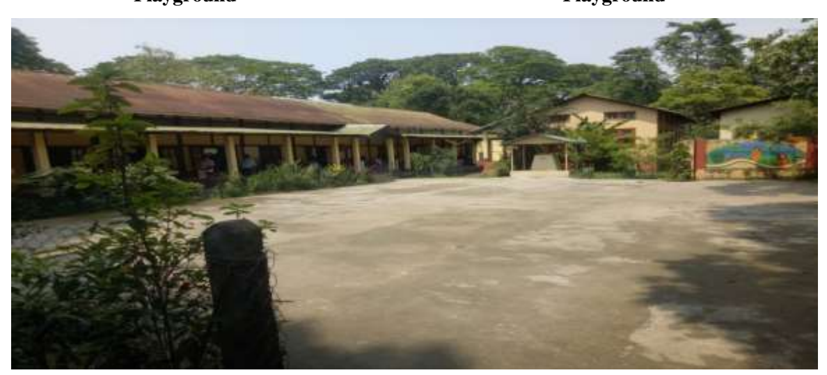
Campus of Sonaram H.S School