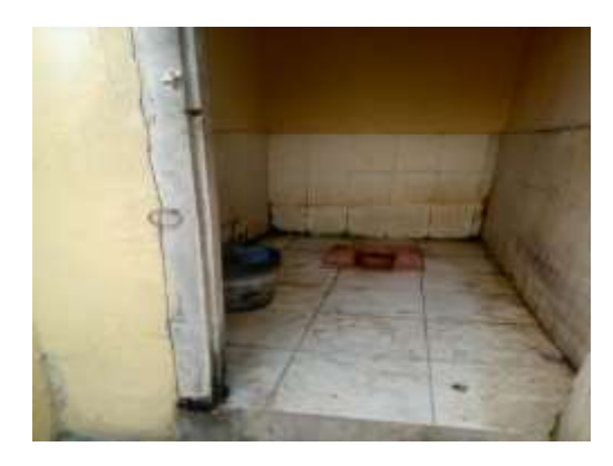
Toilet and urinal