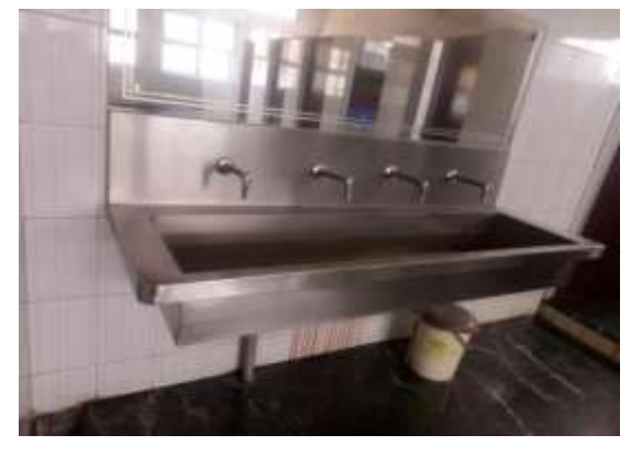
Water facility in Toilet and Urinal