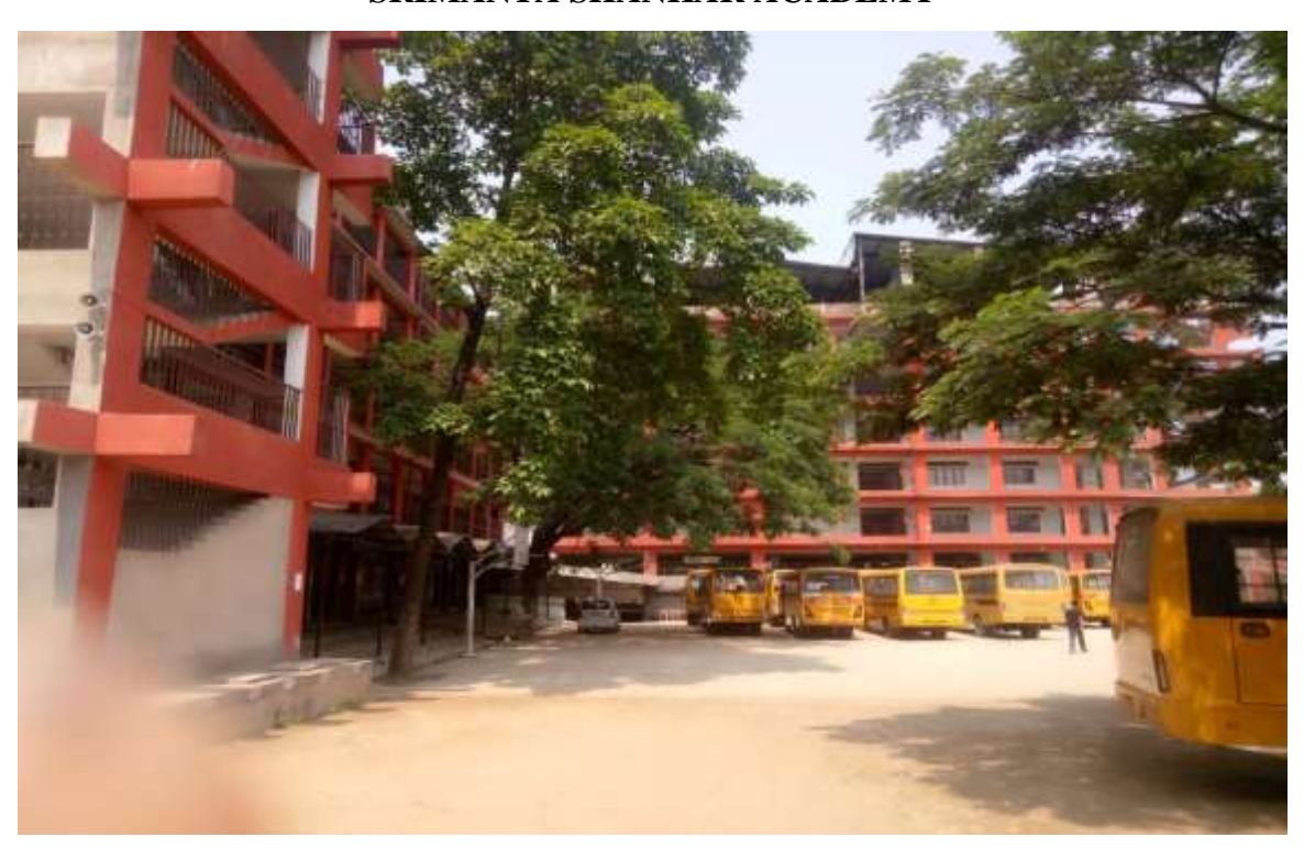
The campus of Srimanta Shankar Academy