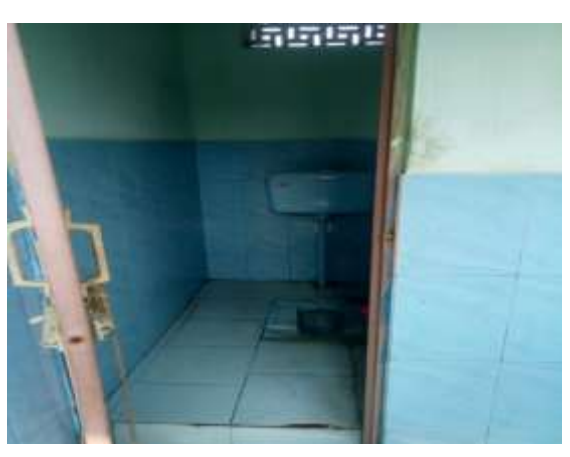
Toilet nad urinal facility