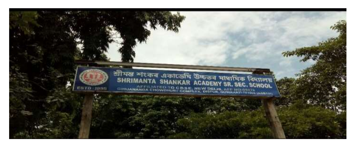
Main Gate of Srimanta Shankar Academy