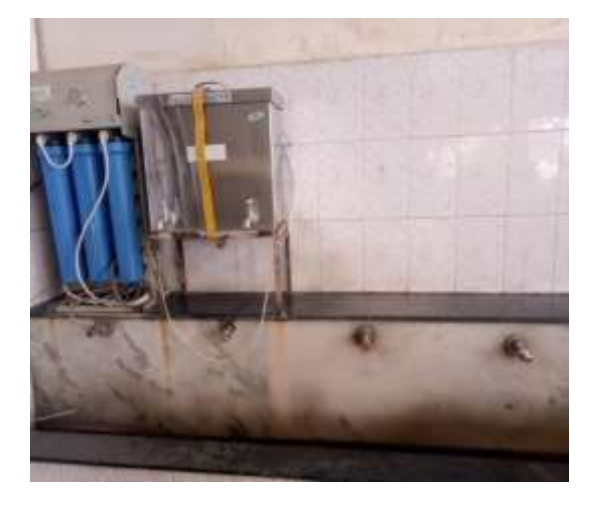
Drinking water facility