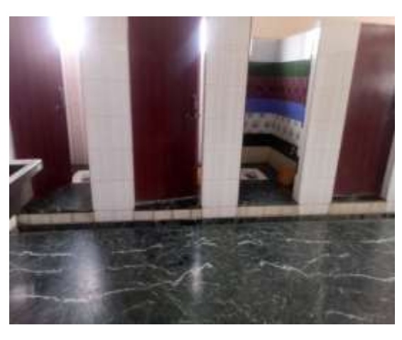
Toilet and urinal facility