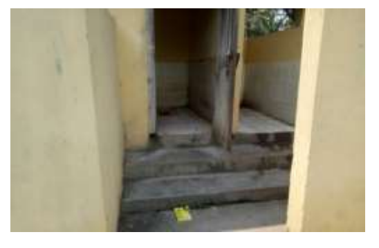
Toilet and Urinal