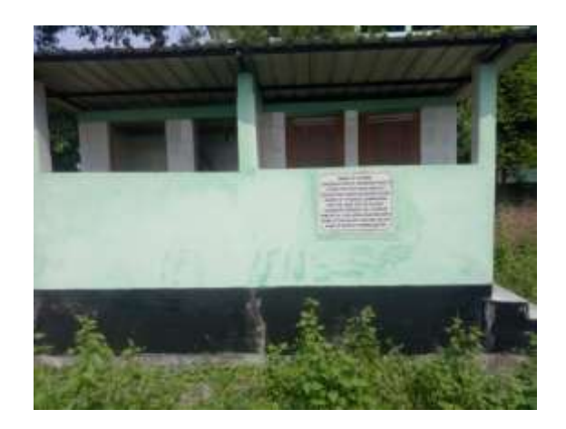
Toilet and urinal facility