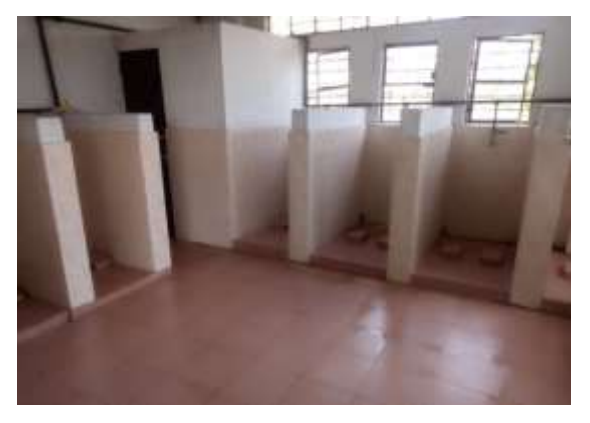
Toilet and urinal