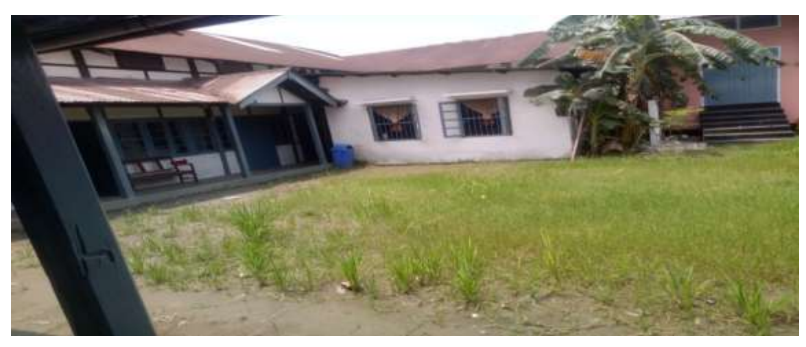
The campus of Arya Vidyapith H.S School