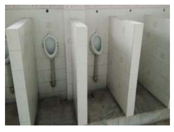
Toilet and Urinal