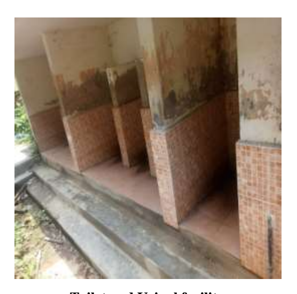
Toilet and Urinal facility