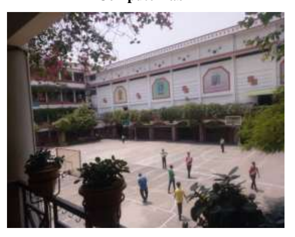
Basketball court cum School Campus