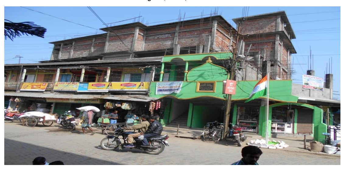
Figure: 3.07 CachariMosjid (1876)

This is the gate of CachariMosjid, Sadarghat, Silchar. The gate was built in 2008 as reported by the Mosjid Committee. It bears the year of establishment of thisMosjid.