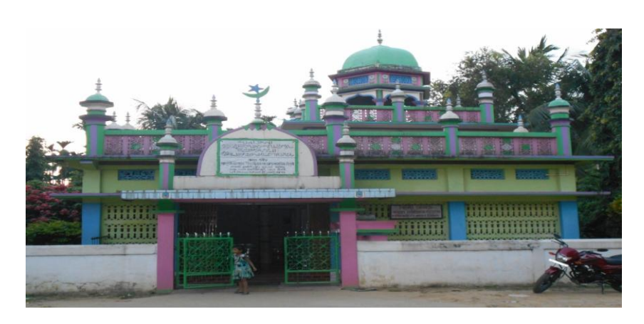
Figure: 3.56 Dargah of Abdul Aziz Choudhury (1984)

Sufi saint Abdul Aziz Choudhury known as " TantooerSaheb " was born in the village Tantoo, about 7/8 K.M. away from Lala town of Hailakandi district. <sup>164</sup> The life of Abdul Aziz Choudhury was full of mystery and miracle. Countless supernatural events