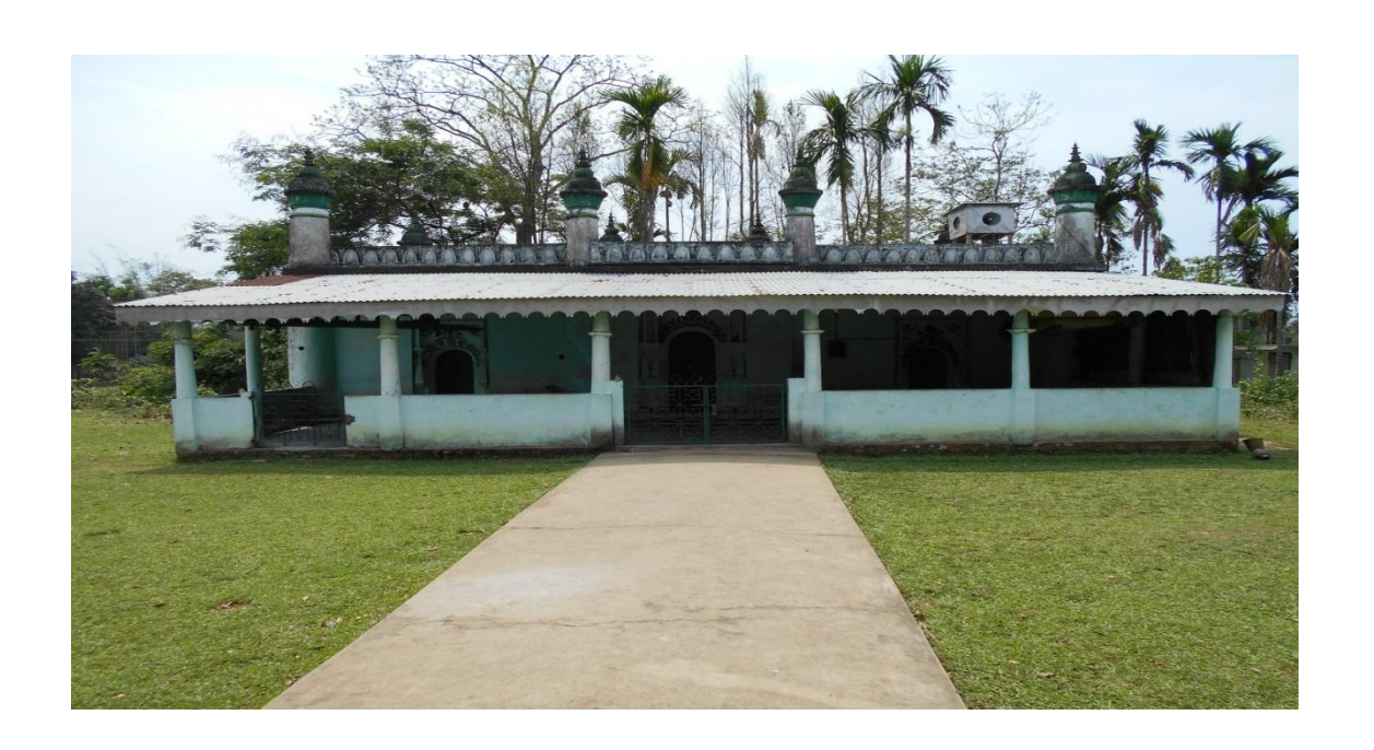
Figure: 3. 32 KachukhauriMukambariJameMosjid

About 500 years ago a leading Sufi Saint named Shah Bakshah Ali arrived at Kachukhauri village of Ratabari from Iraq. He had tremendous miraculous power that greatly attracted the local people who gathered around him regularly. Shah Bakshah Ali started preaching Islamic religious value and for that purposes established a Mosque or Mosjid that ultimately known as KachukhauriMukambariJame Mosjid . The Mosjid is about 500 years old though its present structure was built 124 years ago in 1892 A.D. The Mosjid presently covers more than 300 families under villages Kachukhauri,