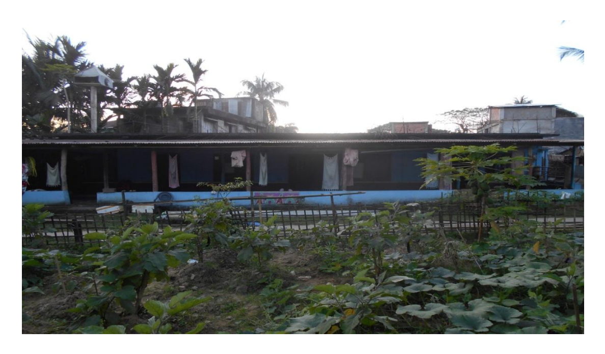
Figure: 3.52 Gharmurah Bazar Mosjid (1979)

It is situated at Gharmurah bazar and on the bank of river Deleswari , a few K.M. away from Mizoram border. It is also known as Gharmurah Bus Station Mosjid . This Mosjid