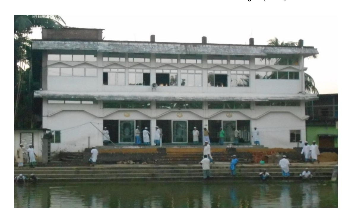
Figure: 3.47 Sahabad Madrassa JameMosjid (1899)

It is located at Sahabad adjacent to Hailakandi-Mizoram national highway under Katlicheera constituency of Hailakandi district in Barak Valley. The Madrassa was founded along with a Mosjid in the year 1899 A.D. and the Madrassa is within the Mosjid campus. It is called DarulUlumSahabad Madrassa . It was initiated by Hazi