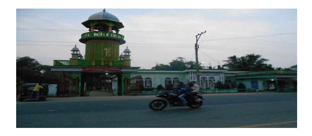
Figure: 3.21 Gate View of Dargah of Charki Shah

The Dargah of Sufi saint Charki Shah lying at Saidpur adjacent to Silchar- Aizawl road. Reportedly he possessed a stick which he used to revolve in circle and accordingly he was known to people as Charki Shah. Many people offer the money to donation box in their way of journey when they cross through the Silchar -Aizawl road. People irrespective of caste and creed visit his dargah every day for fulfilling their desires.<sup>82</sup> He died on 26<sup>th</sup> July of 1952.<sup>83</sup>