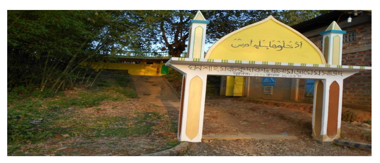
Figure: 3. 38 Gate View of GanshahmarchakDarus Salam Jame Mosjid

The Gate of above Mosque was construction in 2011 A.D. as reported by the local inhabitants. It bears the year of establishment of the said Mosque.