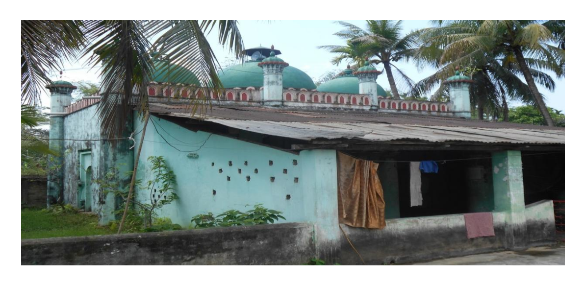
Figure: 3.45 MatijuriJameMosjid (1815)

The Mosjid is located at Matijuri adjacent to Hailakandi-Silchar national highway and on the bank of river Khatakhal , is one of the oldest Mosjid in Hailakandi district. The habitation of Matijuri and its surrounding was started in the 17<sup>th</sup> century A.D. and people say that it was deep forest and cut down the forest by the Muslim inhabitants with a view to perform religious prayer, at first a bamboo structure Mosque was made by the local Muslims in 1815 A.D., as reported by old aged people. In 1945 A.D. the Mosque was rebuilt with a mixture of lime, bricks and sand etc. which was known as Chun-Churky . The breadth of the walls was three feet each. The roof of the Mosjid having three domes was also prepared with such mixture. It is called MatijuriPaccaMosjid because it is first built by such mixture in the entire locality. The