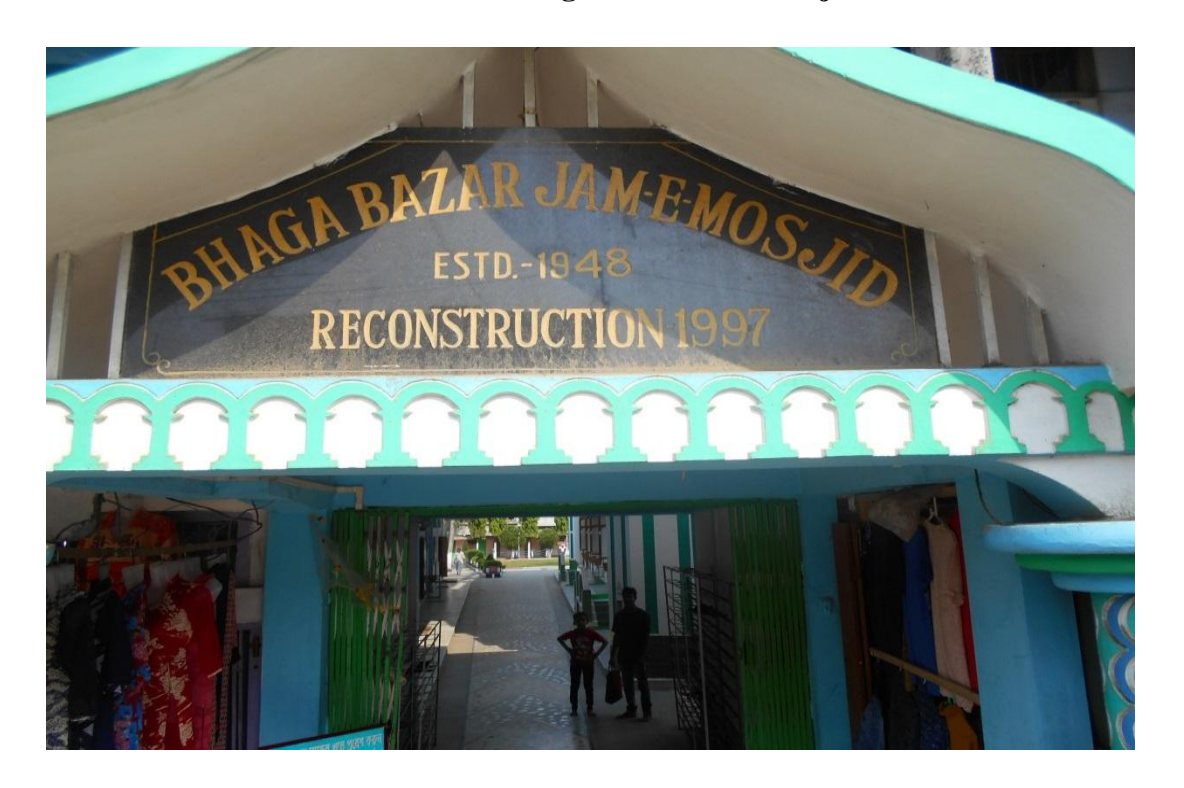
Figure: 3.15 Gate View of Bhaga Bazar JameMosjid

The Figure 3.15 shows the gate of Bhaga Bazar JameMosjid established in 1948 and reconstructed in 1997 A.D. This magnificent gate was also built in 2004 A.D. as told the president of the Mosjid Committee.