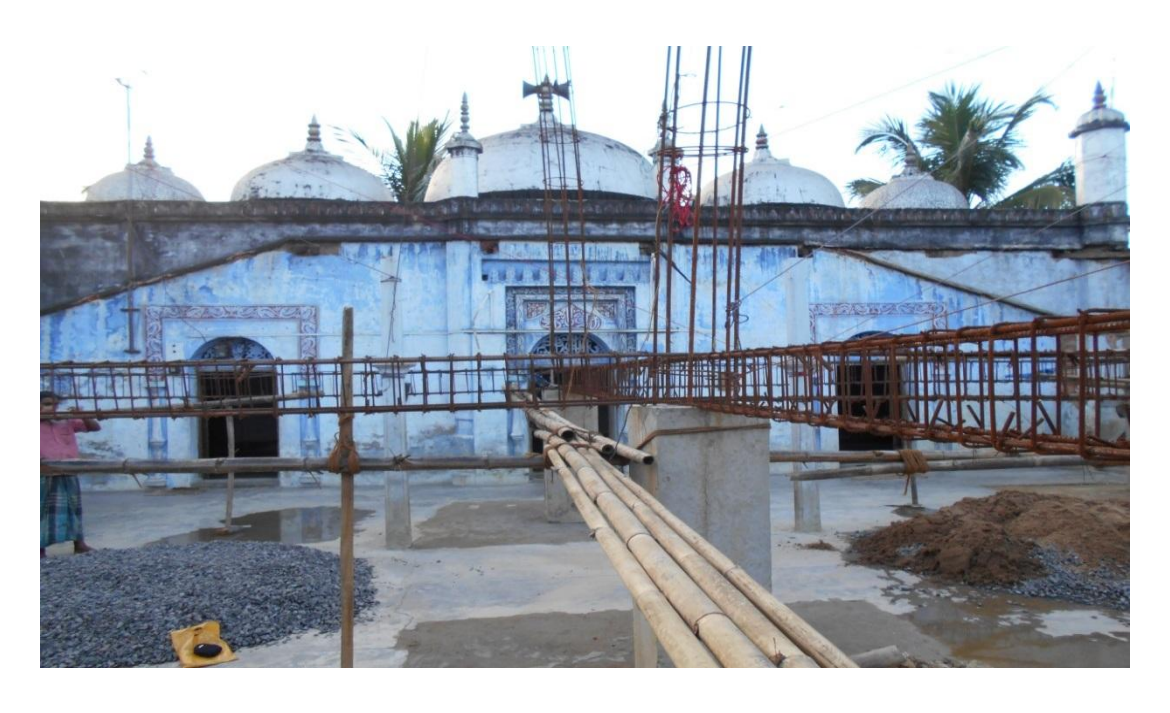
Figure: 3. 46 Boalipar Bazar Mosjid

This Mosjid is located in Boalipar Bazar adjacent to Hailakandi-Mizoram national highway. It was established in the last decade of 19th century. The Mosjid was constructed primarily with tin roofed wooden structure. The Mosjid was reconstructed in the year 1965 as a paccastructure with lime and stone mixture ( Chun Churky )