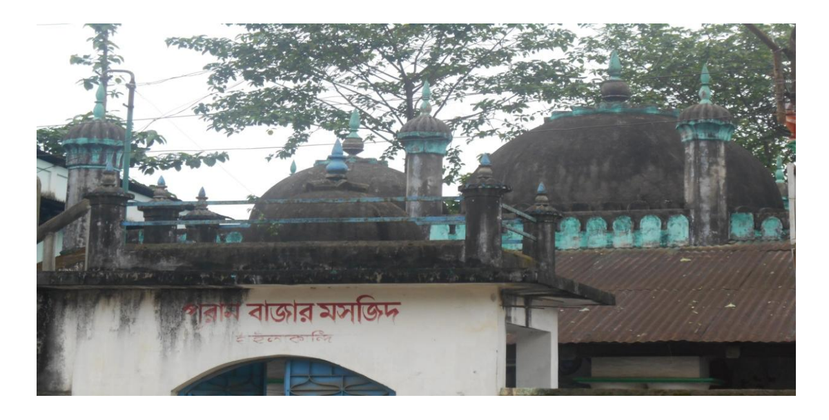
Figure: 3.50 HailakandiPuran Bazar Mosjid (1914)

This Mosjid is situated in Marawari patty and on the Bank of the Dalhesri River & standing near HailakandiSadar Police Station.<sup>151</sup> It was constructed in 1914 A.D. with a mixture of lime, bricks and sand etc. which was known as Chun -Churky . The