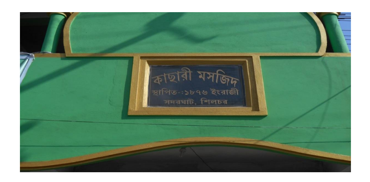
Figure: 3.06 Gate View of CachariMosjid

This is the gate of CachariMosjid, Sadarghat, Silchar. The gate was built in 2008 as reported by the Mosjid Committee. It bears the year of establishment of thisMosjid.