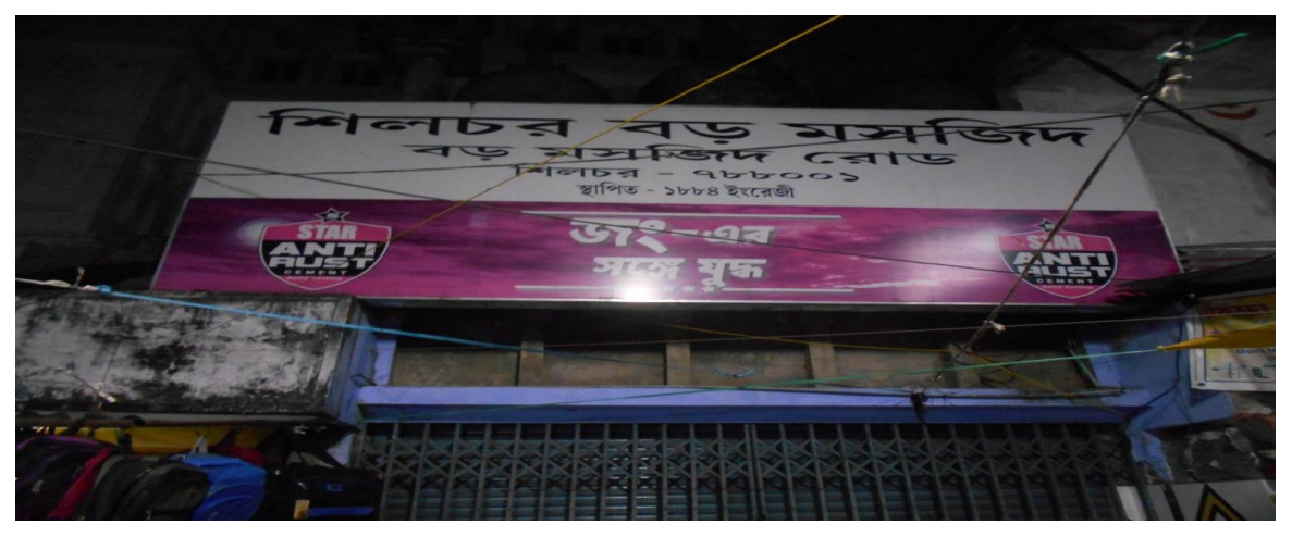
Figure: 3.08 Gate View of SilcharBoroMosjid

This is the gate of SilcharBoroMosjid, Silchar. It was built in 2005 and founded by Star Cement. It shows that SilcharBoroMosjid was established in 1884 A.D.