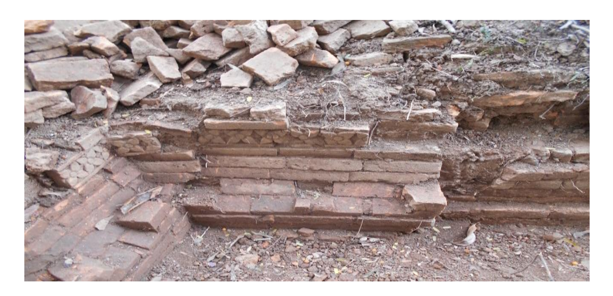
Figure: 2.04 Ruins and Remains of MosjidTillaJameMosjid of 1531 A.D.

The fourth stone inscription is now preserved in the wall of the Settlement Bazar Masjid of Karimganj town. The inscription in black stone records the existence of Masjid in the locality dated 1531 A.D. during the reign of Nusrat Shah of Bengal Sultanate.<sup>45</sup>