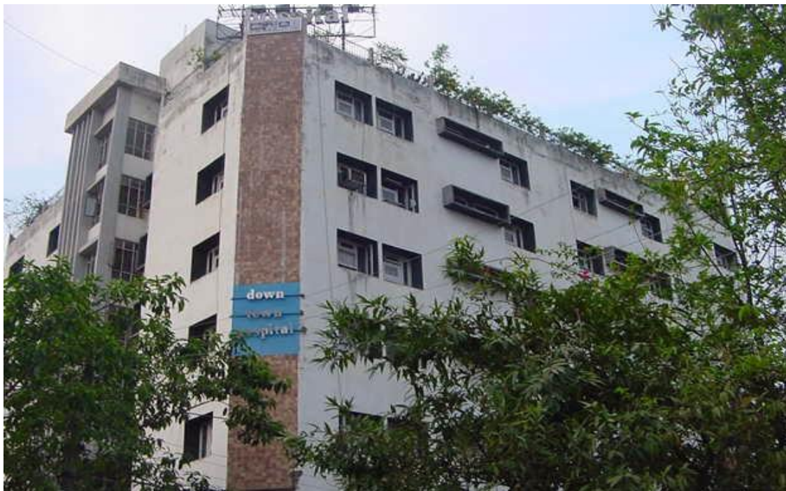
down town hospital ltd., Guwahati