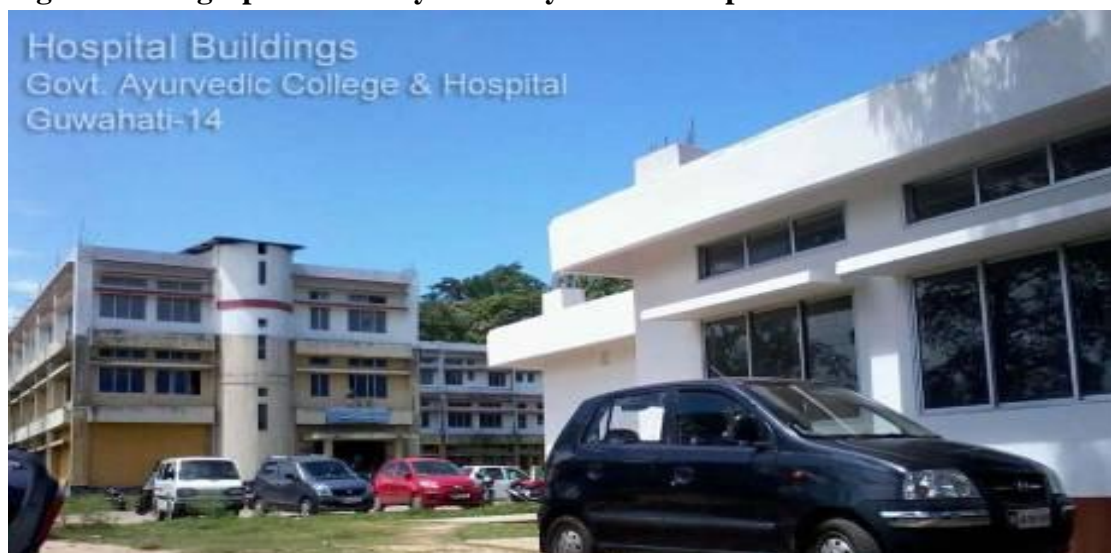
Government Ayurvedic College Hospital, Jalukbari