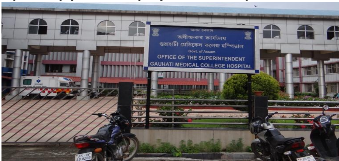
Gauhati Medical College Hospital, Guwahati